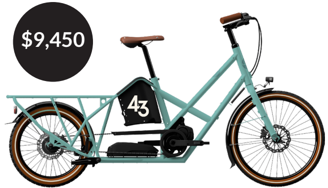
Alpster AutomatiQ with Enviolo HD CVT