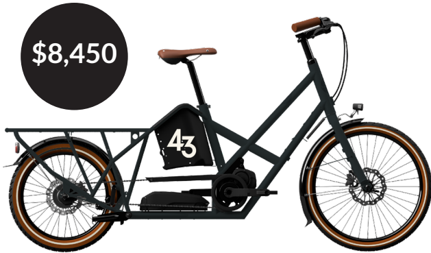
Alpster Manual with Shimano Nexus Inter-5E